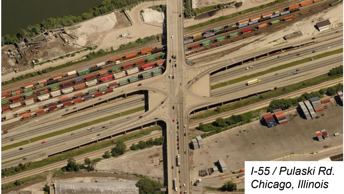
I-55 / Pulaski Rd. Chicago, Illinois